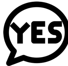
Difficult to say no